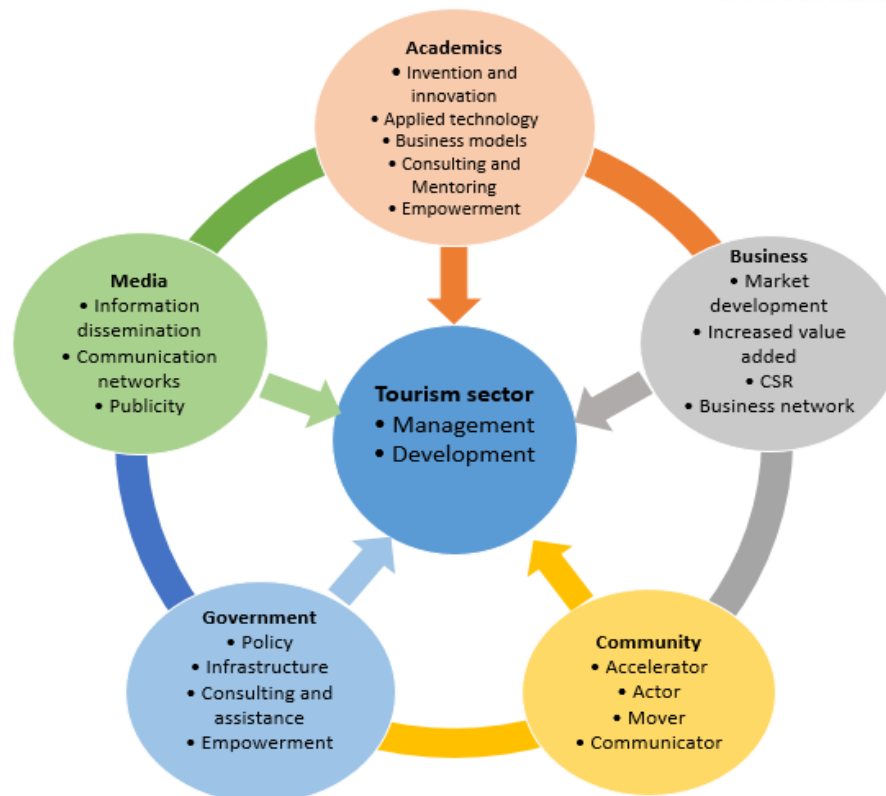
Figure 2: Pentahelix synergy in tourism development

The government's alignment with developing tourism in Indonesia is marked by the recognition of this sector as one of the economic pillars, especially in bringing in foreign exchange, increasing regional income and absorption of investment as well as reducing unemployment by opening up many new jobs. However, the development of this sector cannot only depend on the government, given that many parties are involved and have an interest. Therefore, there is a need for synergy in the management of the tourism industry, especially when faced with the situation in this new normal era. The pentahelix synergy in Batu City tourism development is as shown in the following figure: