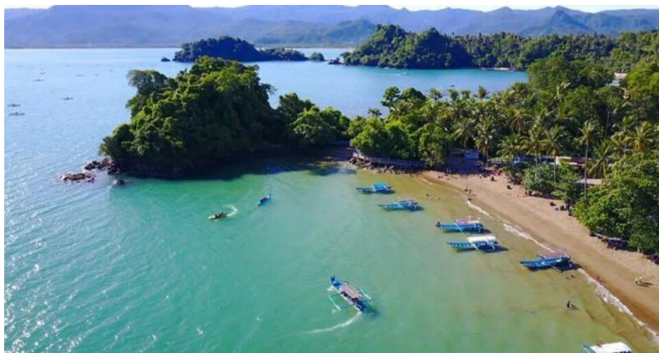
Figure 2. Prigi Beach seen from a drone aircraft