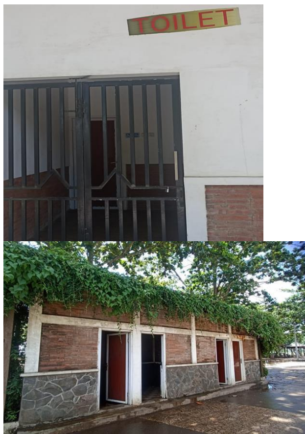
Figure 4: The Toilet is not functional and Looks dirty