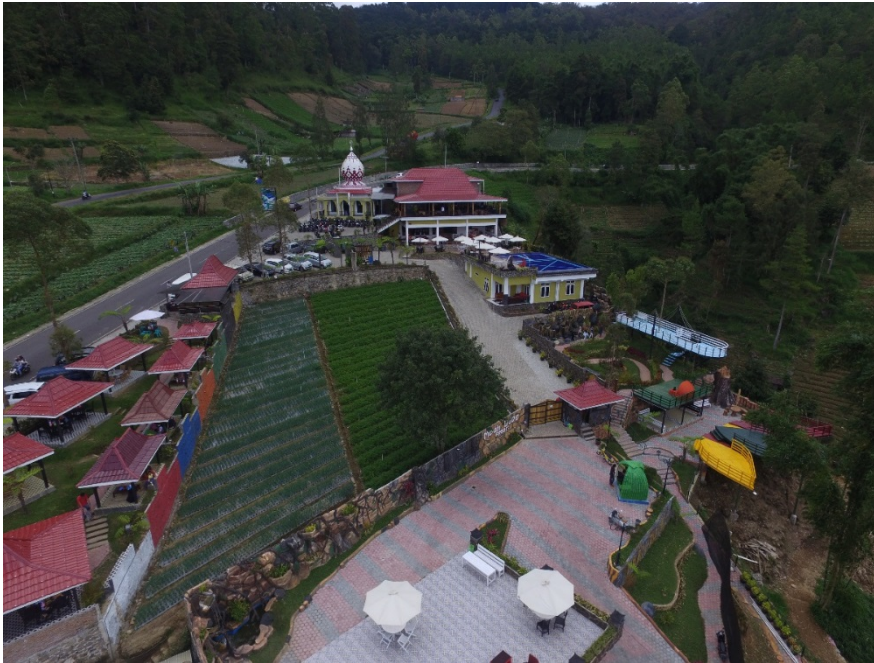
Figure 4 : Aerial View of "MDAH DJOE RESORT" Magetan