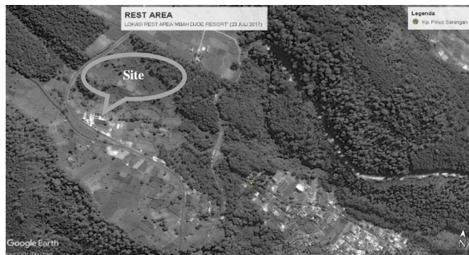
Figure 3. Research Object Location

tourist destinations that can be easily reached. This place presents natural charm and attractive and attractive tourist rides as an alternative tourist destination in Magetan Regency. The facilities are fairly complete, namely there are Lodging in the form of: Hotels, Villas, Cotage, then Restaurants, Meeting Rooms, Swimming Pools, Amusement Rides and public facilities such as Mosques, Toilets, Parking lots, Gazebo and others. This area is managed by individuals who try to present an artificial tourism object that is different from other places by providing cheap recreational facilities for the surrounding community and tourists, with the nature of the plantation as its main attraction (see figure 3).