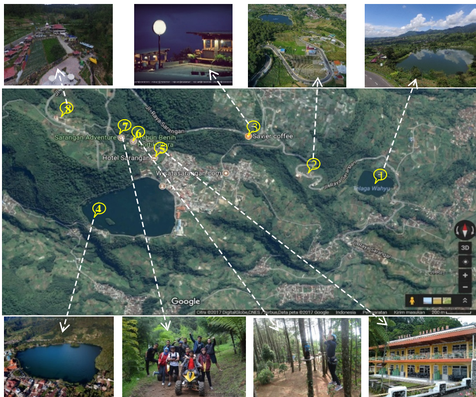
Figure 4. Location of Study to the other tourism object