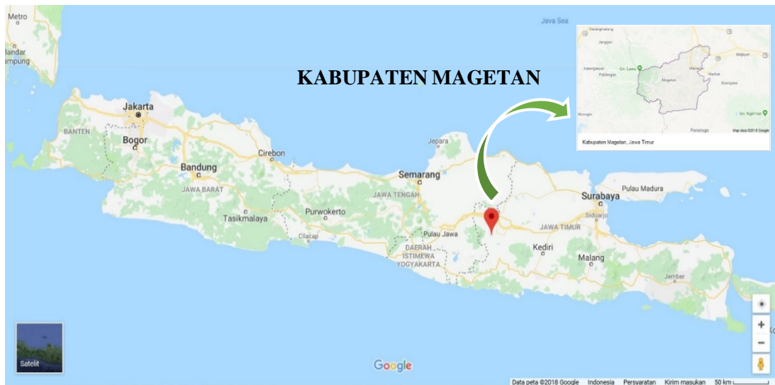
Figure 1: Area Study

Travel destinations that are so diverse in Magetan Regency, become a special attraction for local and foreign tourists. In relation to physiographic characteristics and landscape conditions, the problems that need to be prioritized are the intensity of changes and their effects on the surrounding environment and the ecological balance of the region caused by changes in land functions from open spaces to built areas. Accumulatively, the intensity of regional development will affect the sustainability of the ecosystem. The model for developing an environmentally-friendly tourist area is one of the concepts that need to be considered so that the carrying capacity of the area and the environment can be well maintained. Because it is often found that most tourist areas in Magetan Regency do not have a significant role in realizing a clean and sustainable environment, they often contribute to environmental pollution through waste generated.