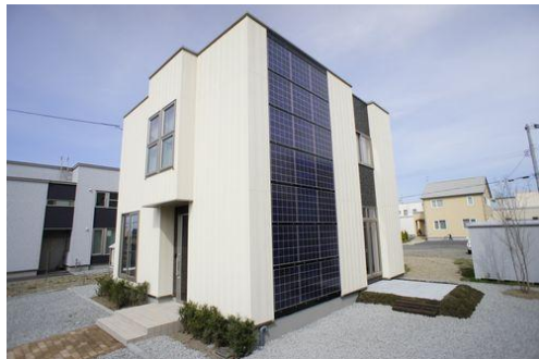
Figure 3. Solar panel module applied on the wall of the building

The application of solar panel modules will be an important factor in design processing and it will become a unity part of residential buildings.