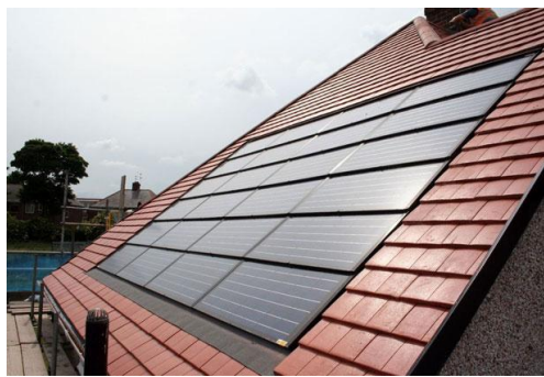
Figure 3. Solar panel module on the roof building