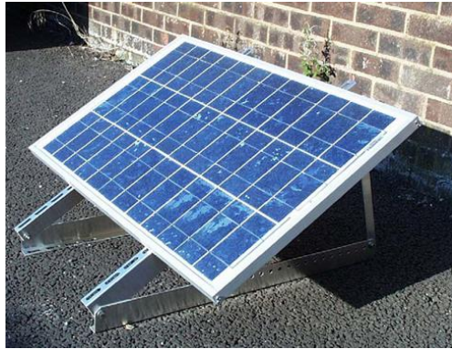
Figure 3. Solar panel module